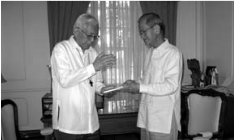
Archbishop Rosales of Manila blesses the Volumes with Howard Dee, on September 8, 2005.

The passing of the torch is now completed. This amazing story continues in our own lives as we face the coming trials and changes in the world that will prepare mankind for the New Time when justice, peace and love will reign with the Savior King.