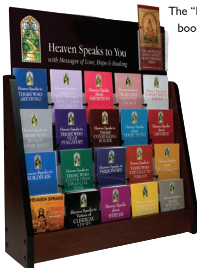
The "Heaven Speaks" booklet series